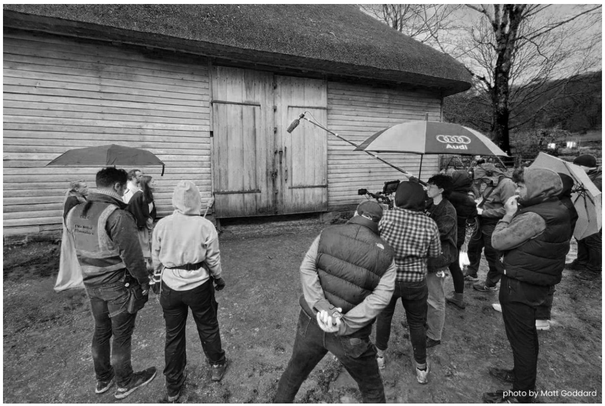
The crew on location for The Barn (2024)