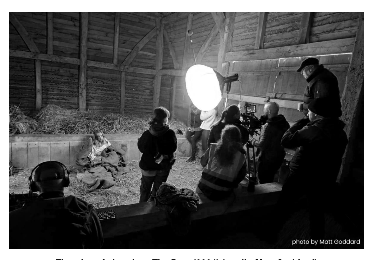
First day of shooting, The Barn (2024)