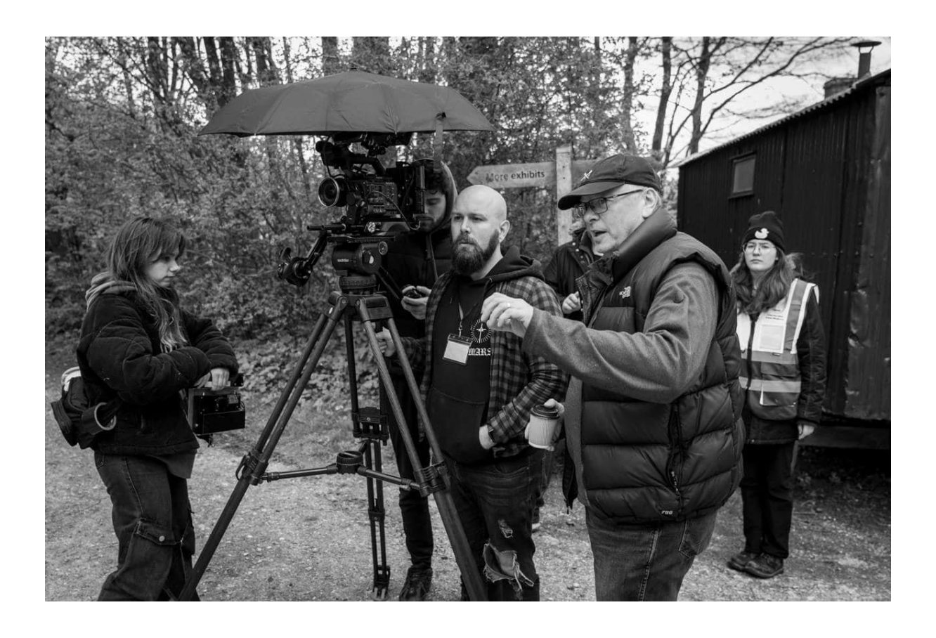
Director and DOP on location for The Barn (2024)